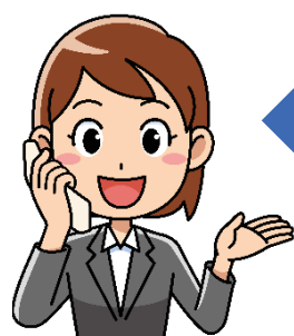
Call Center (Interpreter)

Opening hours: 24 hours (including Saturdays, Sundays and national holidays)